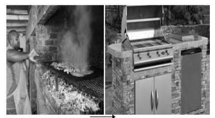
Picture 1: It highlights a need to transit from the excessive use of coal, to LPG for braai activities, for example.

Picture 2 below shows incandescent lights and solar LED lights.